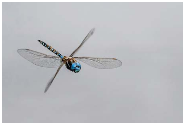
03-Blue-eyed Darner in Flight (Rhionaeschna multicolor).jpg