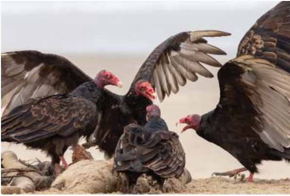
22-Turkey Vultures at Beach Picnic.jpg