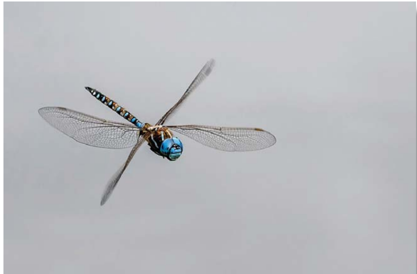
Blue-eyed Darner in Flight ( Rhionaeschna multicolor ) Karen Schofield