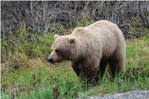
23-Young Grizzley Grazing in Denali National Park.JPG